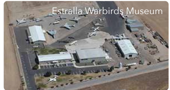
Estrella Warbirds Museum

If the Driving Tour doesn't sound like your cup of tea, you might like to visit the old Piedras Blancas Light Station , 13 miles up coastal Route 1, which is named and signed Cabrillo Highway . You can tour the ground on your own. A morning guided tour is available for you to book before you get to the meet at www.piedrasblancas.org (about $10 per person). It's recommended to book well in advance. Whether on your own or with a pre-booked tour, allow at least a half-hour to stop at the San Simeon Elephant Seal Rookery viewing point along the way. Directions will be provided in your welcome packet.