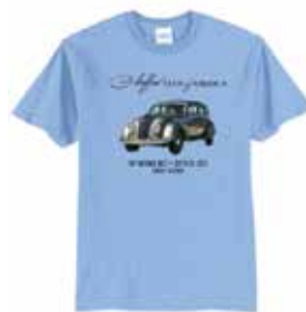
Regular tees have front printing only

Both styles are available in S M L XL 2X and 3X. The pocket tees are Tall in all shirt sizes.