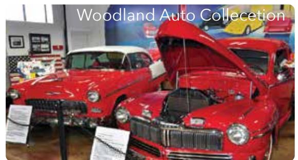
Woodland Auto Collection