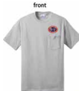
Pocket tees have printing front and back